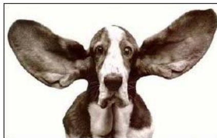
Tune in to Youth Research!

The success of these podcasts means that the Partnership intends to invest in them in the future. They allow those who cannot attend our seminars to experience them (almost) live !