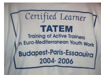
Training of Active Trainers in Euro-Mediterranean

Their role in the programme will be even more important as the new national structures for the Euro-Med youth programme are progressively put in place and the programme will develop to the level of the expectations it created.