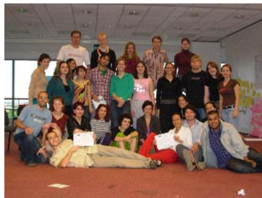
European Citizenship training Module 1 (Budapest, Hungary–June 2006)

Module 6: "Role of Youth Work in Participation" (Rome, Italy): 23 – 29 October 2006.